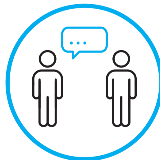
Wellbeing of staff and customers