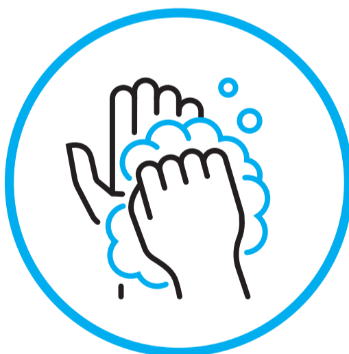
Hygiene and cleaning